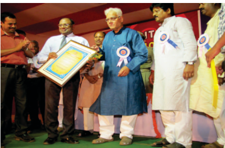
Arrested as "THE MOST PROMISING ENGINEERING COLLEGE OF ODISHA" by fx. Governor of Odisha i at 6th Capital Education Fair, BBSR