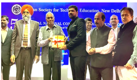
Gandhi Award for Best Engineering College and Best Faculty Chapter-2022