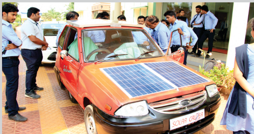
An Eco-friendly Solar charged car self designed & developed by students of EEE Dept.