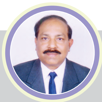
Message of Chairman

All said and done Technical & Management Education continues to be one of the best choices for career making. In this era of dilutions, we, at Gandhi Institute For Technology (GIFT) continue to believe that, the only way to stand to the innumerable challenges of life is hard work. We work hard and expect our teachers & students to do it in the same way. So, we do hope that our students work hard for 4 years during their B.Tech and for 2 years during their M.Tech, MBA & MCA and 3 years during their DIPLOMA programme and enjoy the benefits, for rest 40 years of their lives.