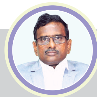
From the Principal's Desk

Today, the role of an Educational Institute is not only to pursue academic excellence but also to motivate and empower its students to be lifelong learners, critical thinkers, and productive members of an ever changing global society. A decade back GIFT pledged to transform technical education in Odisha working under the aegis of the well-established management of the Balaram Panda Trust. The institute is striving hard to make the best possible efforts to inculcate strong values combining with academics and extra-curricular activities.