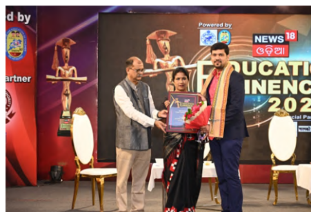
GIFT has been awarded the "Best Emerging Private Engineering College of Odisha" at the Education Eminence Awards 2022 by News 18 Odia.