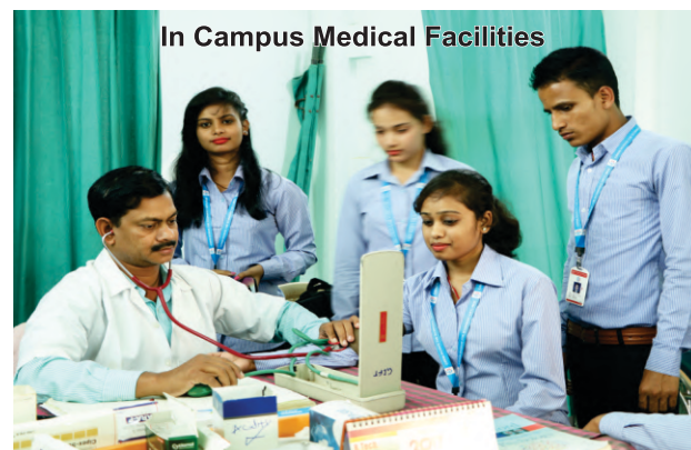
In Campus Medical Facilities