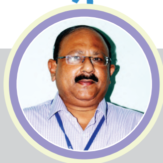
Message of Vice Chairman

To embark on the path of education is a noble affair. It is a holy endeavour and should be holistic as well. We, at GIFT work for nurturing Active, Optimistic, Socially Conscious and Technologically Sound Professionals, who will have a strong penchant to serve human society with willingness and utmost diligence. Our institution runs with a set specific objectives and planned activities for achieving excellence in all spheres of Technical and Managerial Education. Learning should be based on doing things and not merely knowing things. Hence, we welcome you to the world of practical learning holistically.