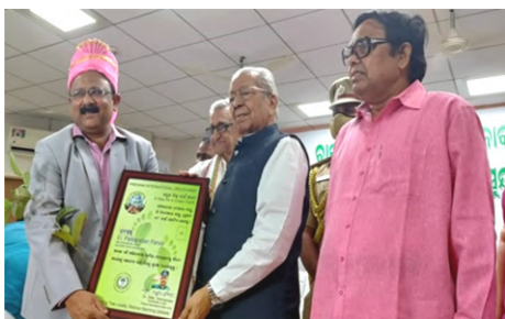
'Prerana International Green Army Award'